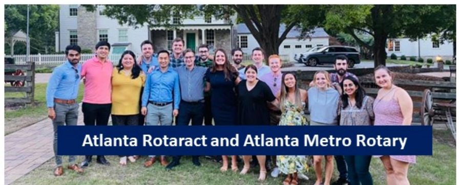
Atlanta Rotaract and Atlanta Metro Rotary