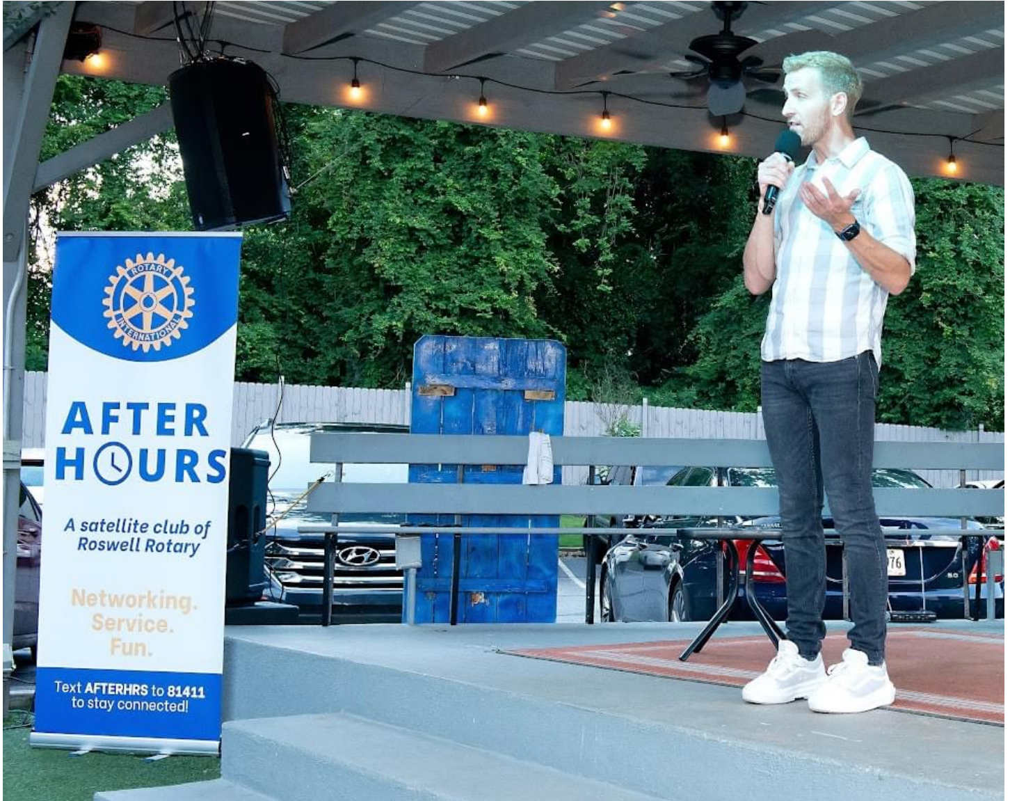
Posted by Becky Nelson July 5, 2023