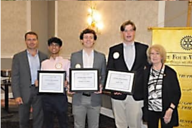
Posted by Sally Platt August 22, 2023