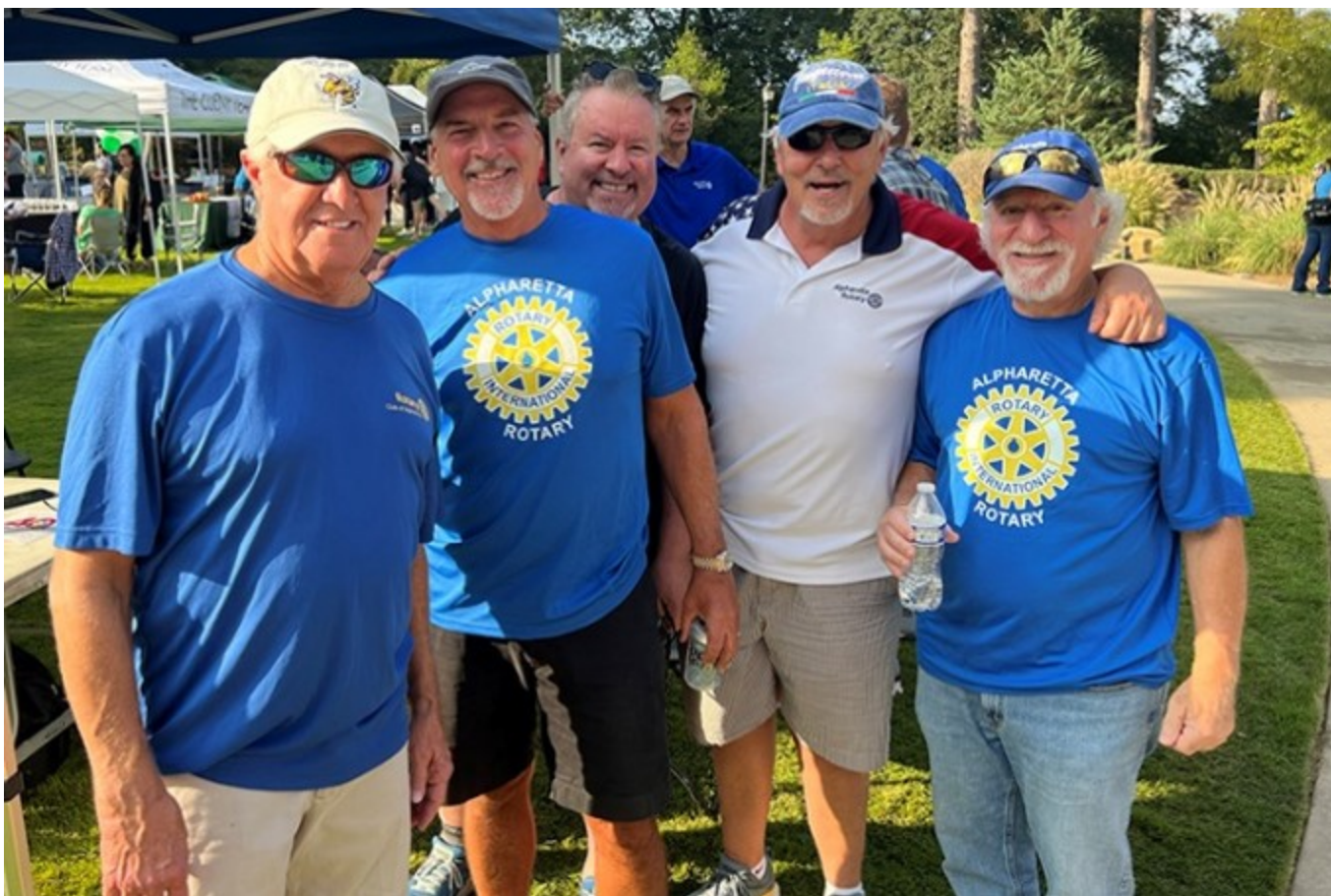
Posted by Clark Savage October 30, 2023