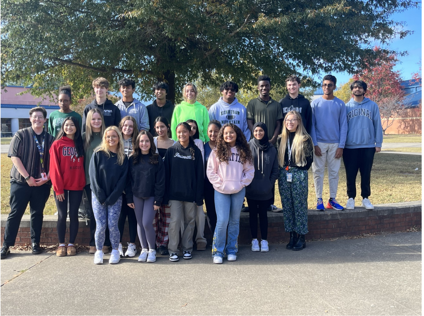
Posted by Nancy Prochaska October 28, 2023

A good time! A good cause! That's Interact!