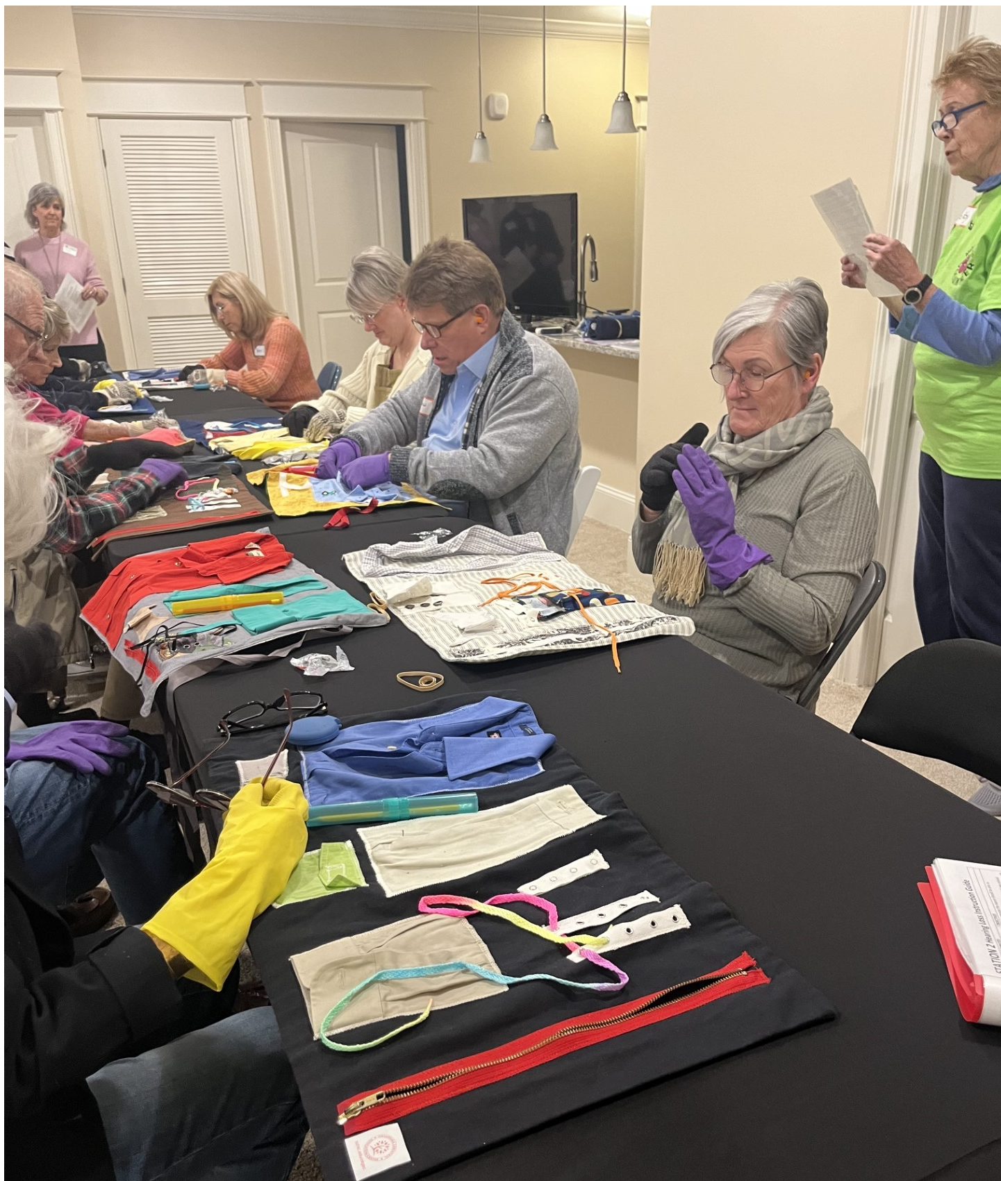
Posted by Nancy Prochaska January 30, 2024