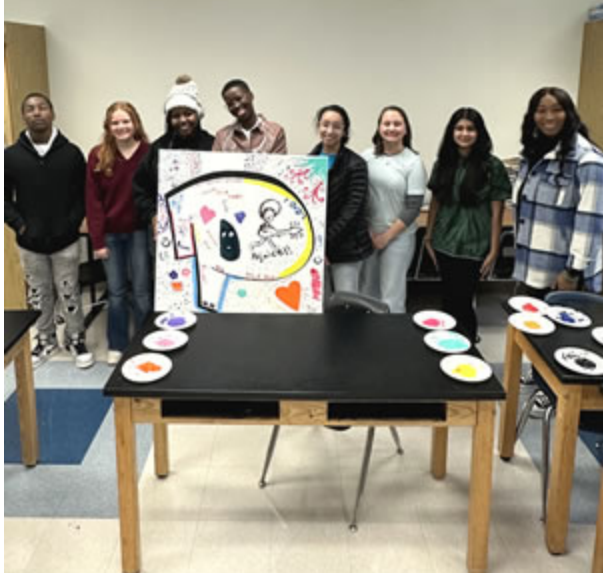
Posted by Rose Caplan March 5, 2024