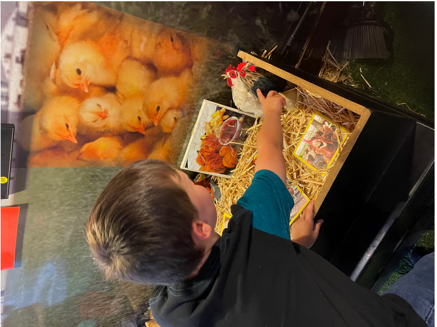
Posted by Nell Boggs June 3, 2024