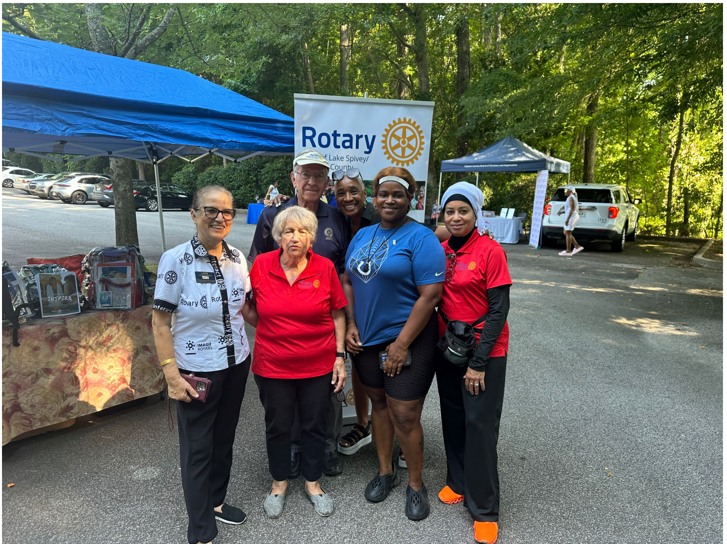
Posted by Gerrian Hawes July 24, 2024