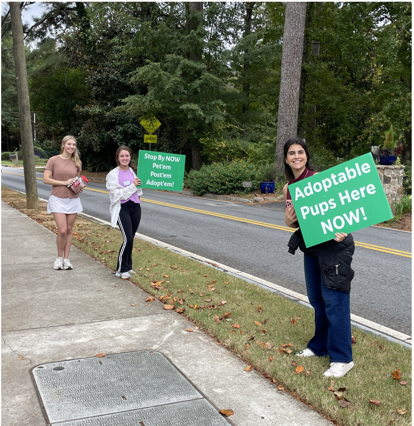
Posted by Shelley Hammell November 5, 2025