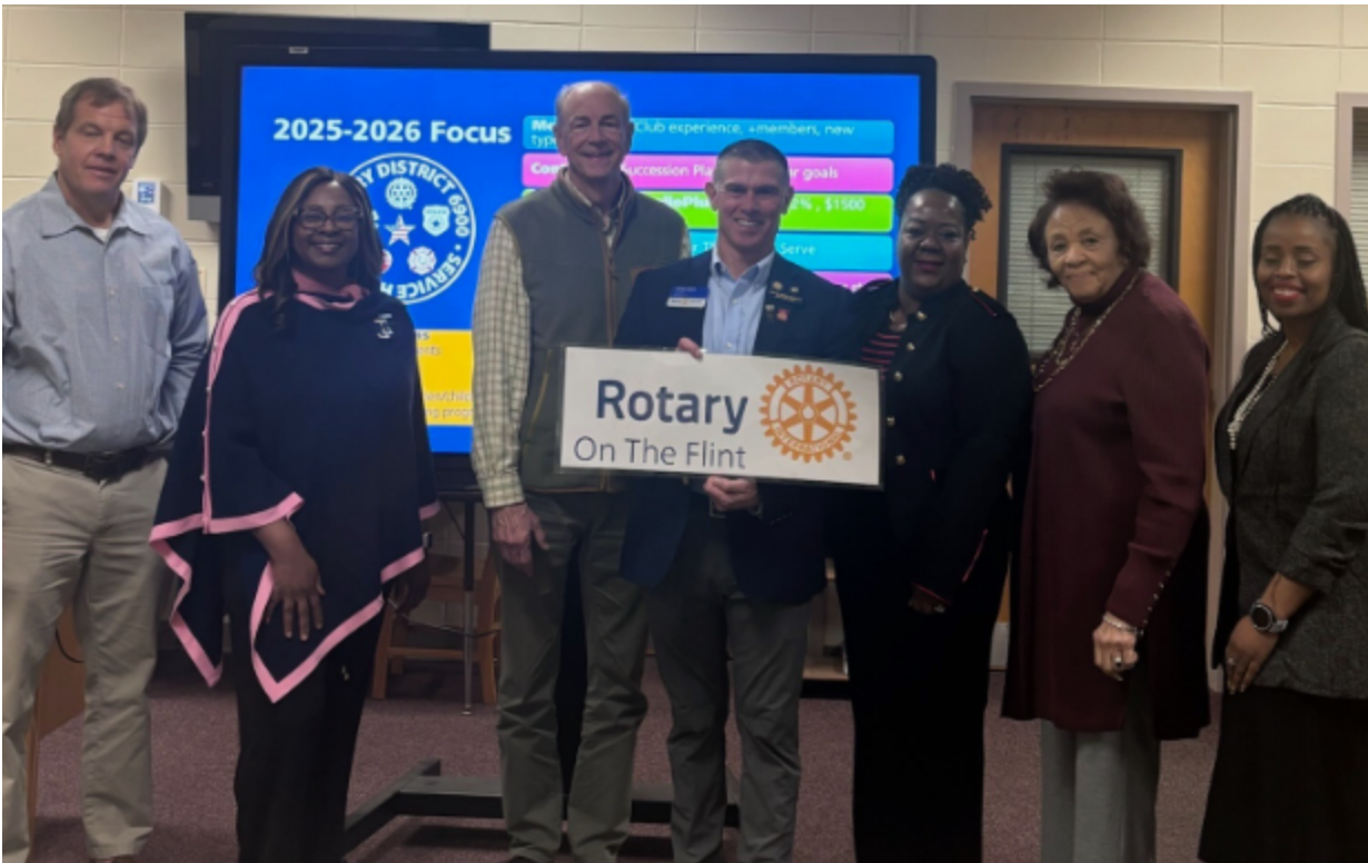
Posted by Steve Ivory February 4, 2026