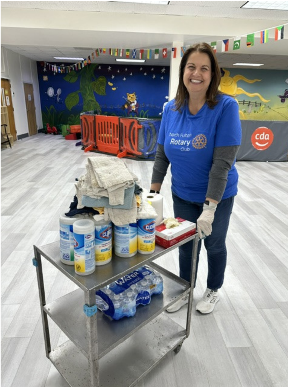
Posted by Lisa Gelber January 20, 2026