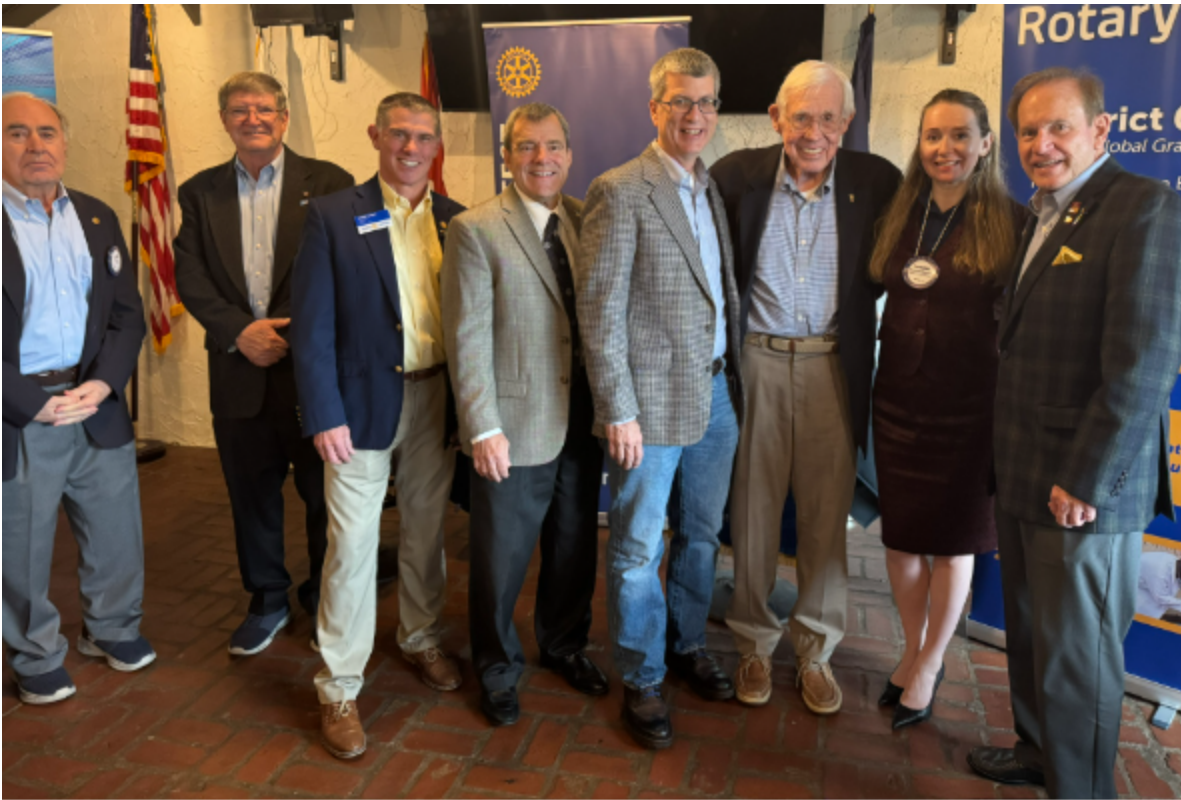
Posted by Steve Ivory February 4, 2026