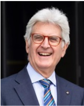
Posted by Jon Yaeger January 19, 2026