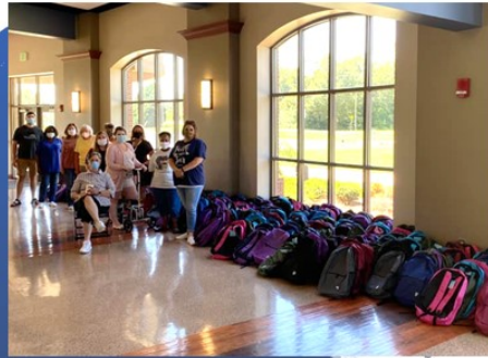
Barnesville helping fill school bags