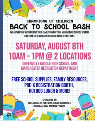
Meriwether County supports Back to School Bash