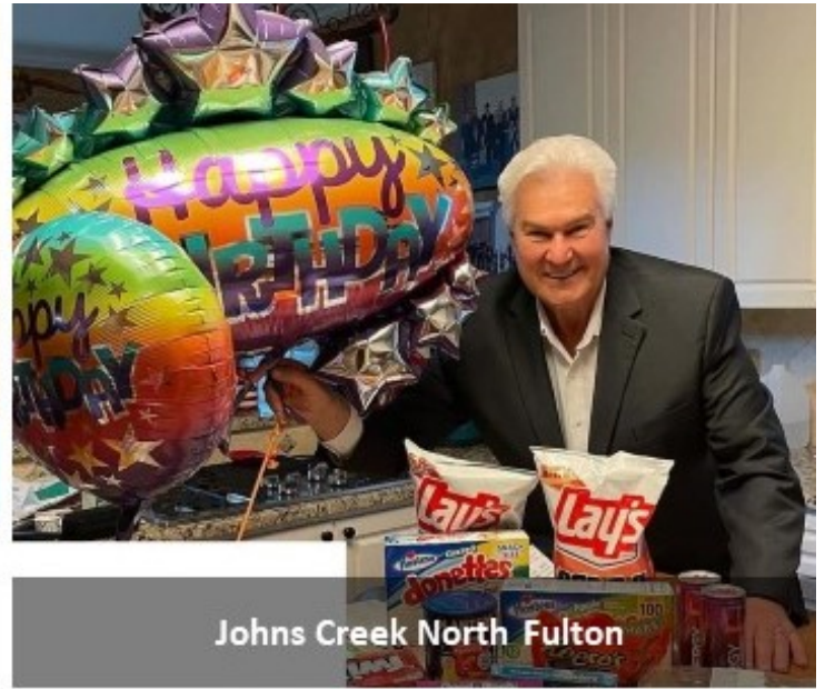
Johns Creek North Fulton