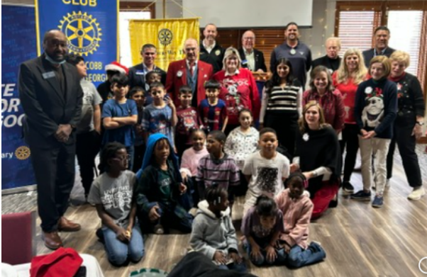
South Cobb Rotary Christmas