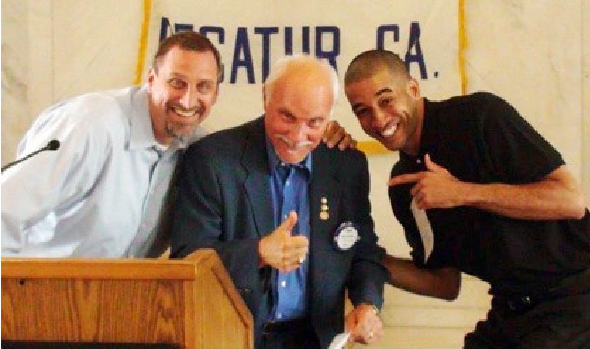
Boys and Girls Club grant recipients with Decatur Rotary's Community Grants Chair

More than 60 District 6900 Rotarians and family members attended this year's Rotary International Convention in Toronto, Canada. We were treated to amazing entertainment and speaker's - including Former First Lady Laura Bush and many more. [more]