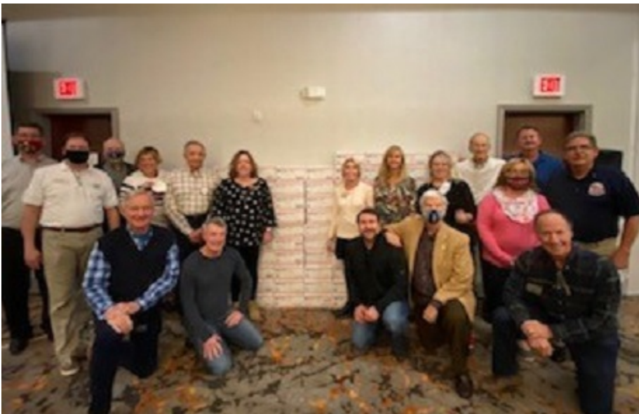
Posted by Trummie Patrick January 10, 2021