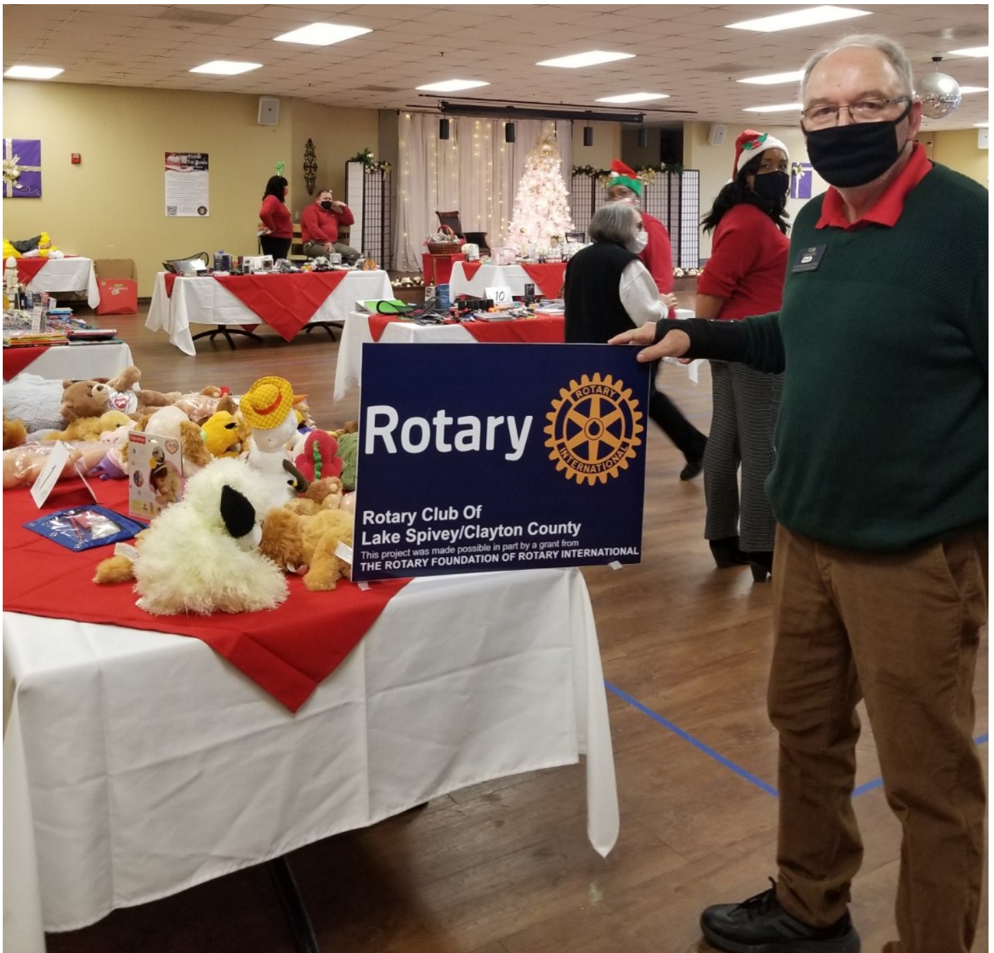
Posted by Ron Swofford January 10, 2021