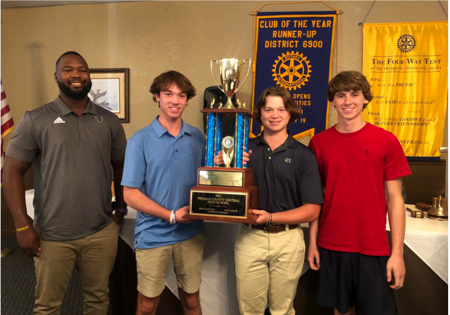
Posted by Adrian Burns December 4, 2021